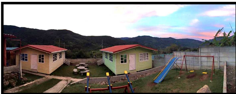
The new children's home! Girls in the yellow, boys in the Green

The amount of money that we did raise will be used to renovate the cabins and build the basic structure of the feeding center. We will still need to finish out the area we are constructing with windows, doors, tables, sinks, storage and a handicap bathroom. The cost of finishing out the structure and equipping the kitchen will be roughly $8000. Please pray for God's provision. However, when finished, we will have facilities to serve the same purpose as the other property but without an additional mortgage!